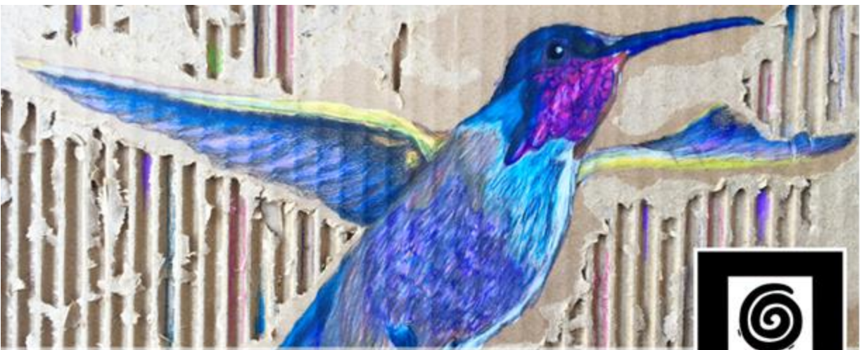
ABBY WHITE, Mixed Media