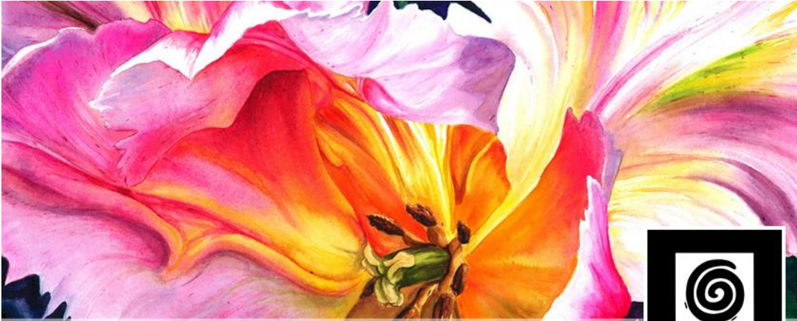
KELLY EDDINGTON, Watercolor