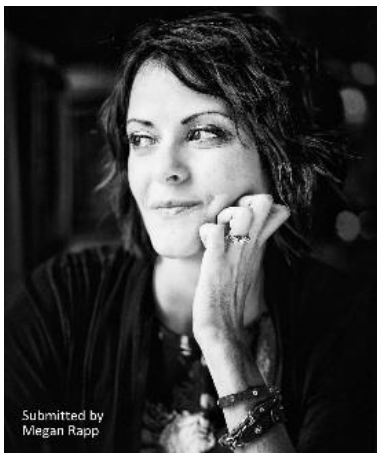
Submitted by Megan Rapp

Open show featuring work submitted by area artists