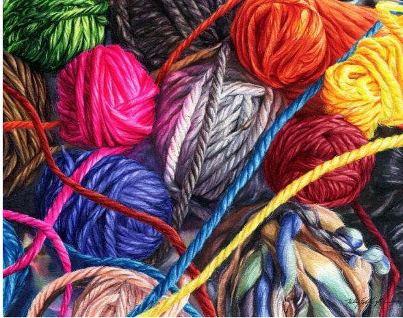
Kelly Eddington – Monroe City – “Pink Heart” – Watercolor