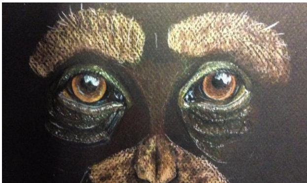
Abby White – Louisiana – “Chimp” – Colored Pencil