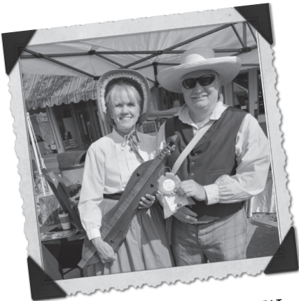
2022 BEST OF SHOW Missouri Dulcimer Co.