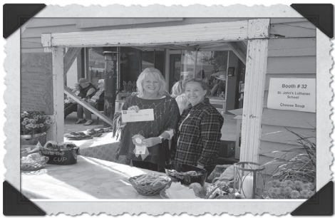
2022 BEST OF SHOW -FOOD- St. John's Lutheran School