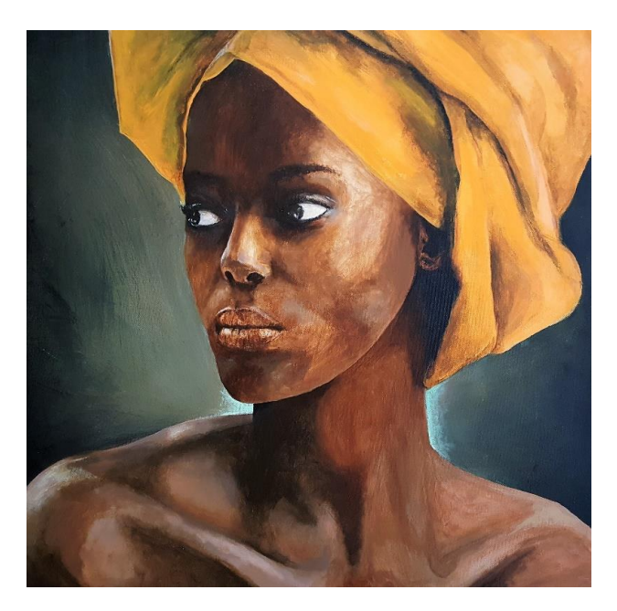
Seth Steinman - Hannibal – "Woman in Orange" - Acrylic