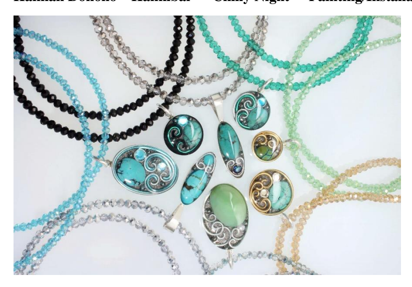
AVA Goldworks - Hannibal - "Turquoise Love" - Jewelry