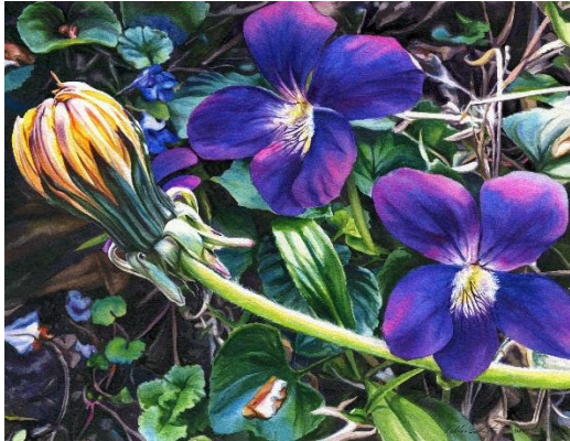
Kelly Eddington – Monroe City MO – “Dandelion with Violets” – Watercolor