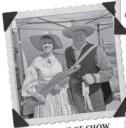
2019 BEST OF SHOW Missouri Dulcimer Company