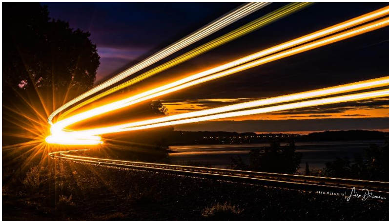
Lisa Delcour – Payson, IL - “Here Comes the Train” – Photography