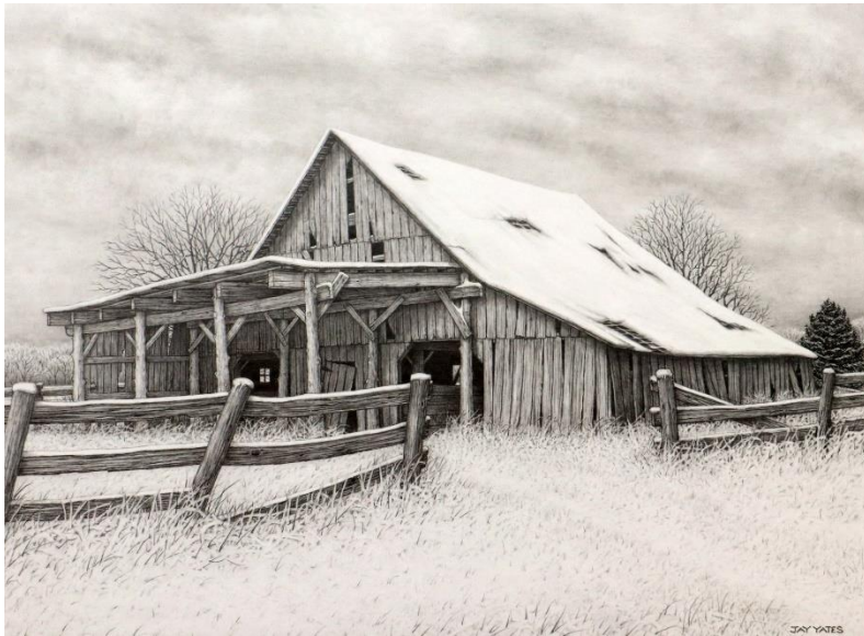
Jay Yates – Monroe City, MO - “Old Whittaker Barn” - Graphite