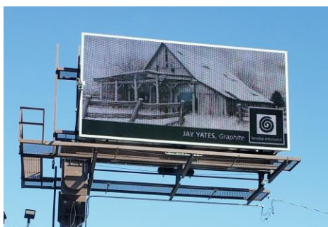
Jay Yates – Monroe City, MO - “Old Whittaker Barn” - Graphite