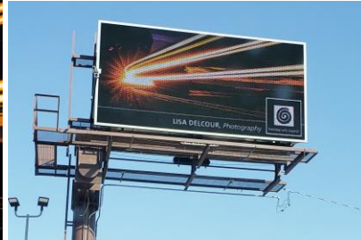
Lisa Delcour – Payson, IL - “Here Comes the Train” – Photography