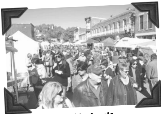
Folklife Crowds Enjoying a beautiful day on Hannibal's Historic North Main Street.