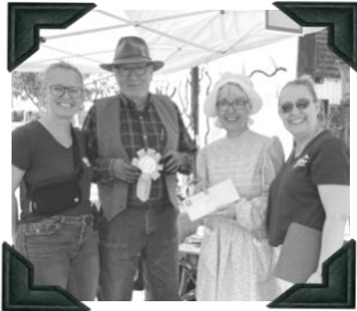
2024 Best of Show - Vendor Bent Tree Gallery