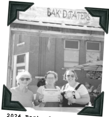
2024 Best of Show - Food Compassion Church "Bak'd Taters"