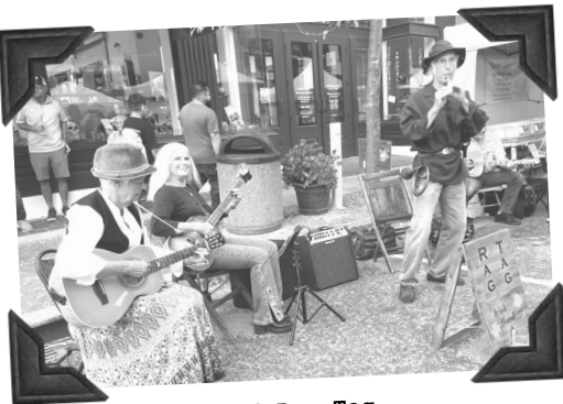
2025 Rag Tag The band entertains the crowd on Hannibal's Historic North Main Street.

Non-Profit Organization U.S. Postage PAID HANNIBAL, MO PERMIT NO. 66