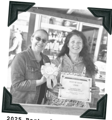
2025 Best of Show - Food Rotary Club of Hannibal Knackwurst/Bratwurst Sandwich